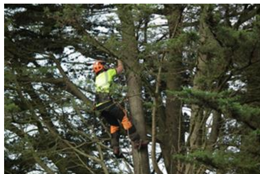
The first ascent