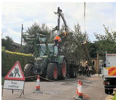
Road closed: equipment in place

One of the problems that we had was that our lease from the council meant that we had to pay all costs relating to the removal of the tree, which in the end cost us around £3000. Possibly clubs in a similar situation to Bristol should have a close look at their lease.